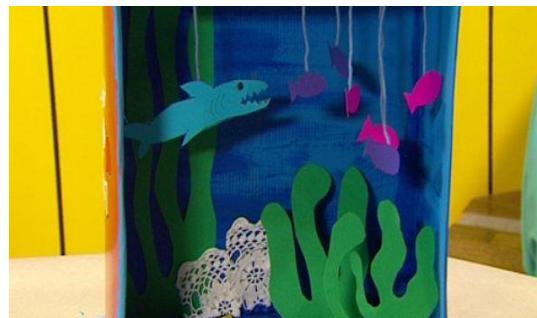
(Under the sea scene)